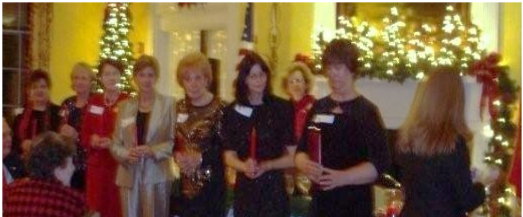
Swearing in ceremony of the 2010 FCRW Officers