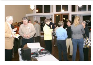
January 26 Meeting