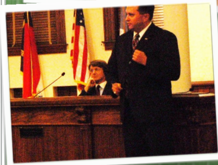
Top photo— County Commission candidates