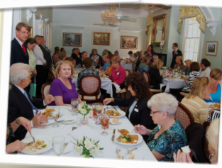
The April 15 meeting of the LCFRWC at the City Club in downtown Wilmington.