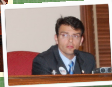
Candidates and spectators pack the Old Courthouse for primary forums.