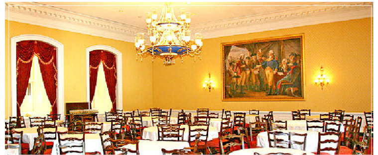
The Member's Ernest S. Petinaud Dining Room